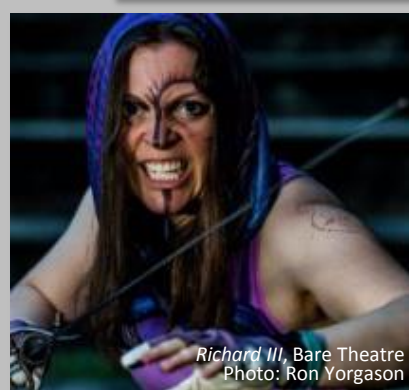
Richard III, Bare Theatre